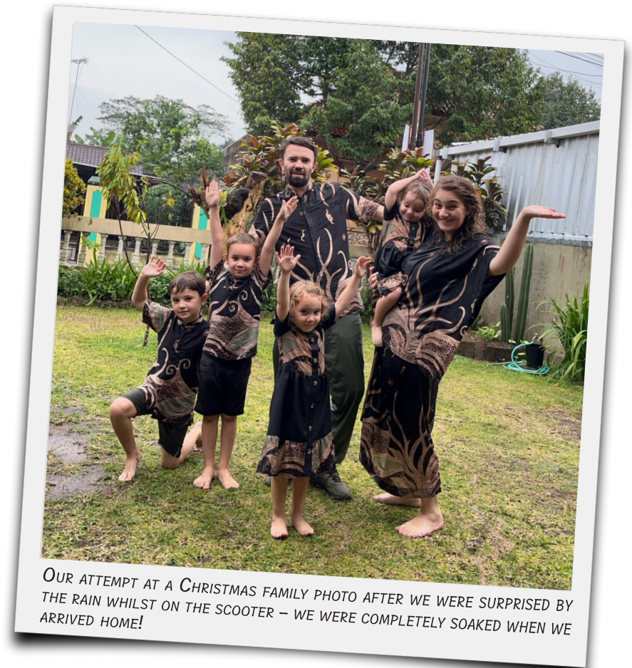
OUR ATTEMPT AT A CHRISTMAS FAMILY PHOTO AFTER WE WERE SURPRISED BY THE RAIN WHILST ON THE SCOOTER – WE WERE COMPLETELY SOAKED WHEN WE ARRIVED HOME!

When we do not call to Him, we end up thinking it’s not worth being here because of who we are – just a random family trying to live